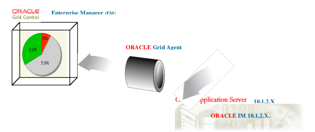
Fig.1. Oracle EM – Oracle Application Server – Identity Management Architecture

comes integrated in a Enterprise Management Metrics System, how this works: