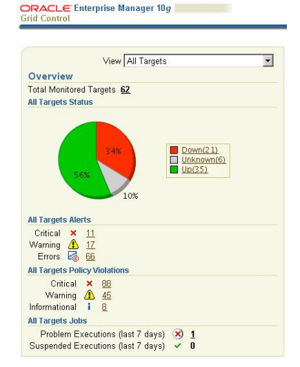
Fig.2. Overview of all targets in Oracle EM

As part of Application Server, HTTP Server manage to handle all the http tasks from either deployed application, or the ones included in the OC4J container, ones that are used for Identity Management: SSO and OIDDAS Delegated Administration Services.